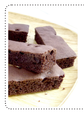
HOME MADE PRODUCTS